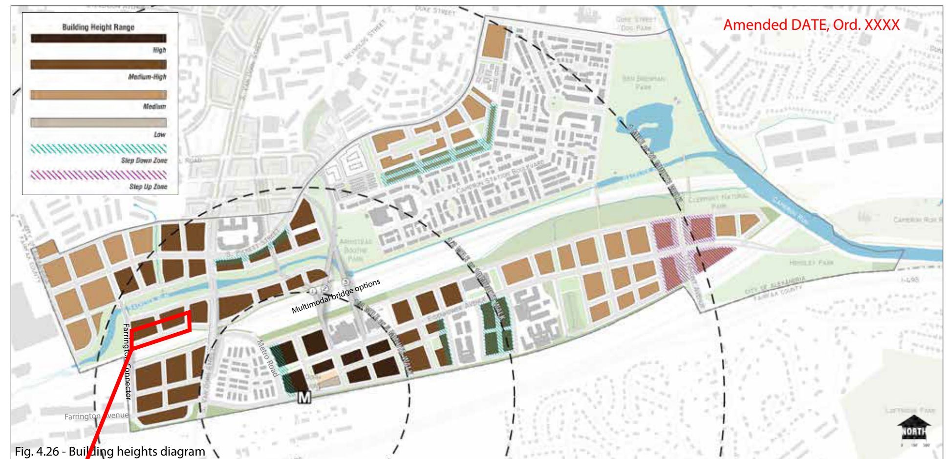
Fig. 4.26 - Building heights diagram