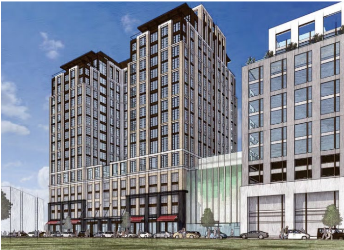
South Tower (Sr. Living) View from John Carlyle Street