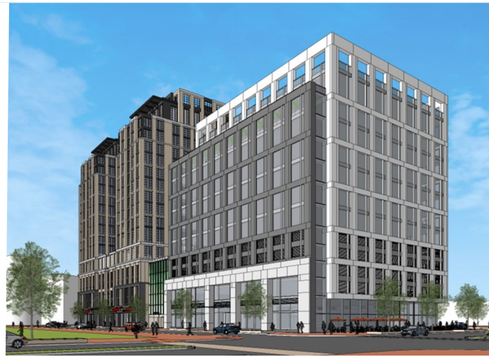
North Tower (Office/Retail) View from Eisenhower Avenue