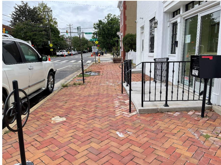
7.7 ft between ramp and curb