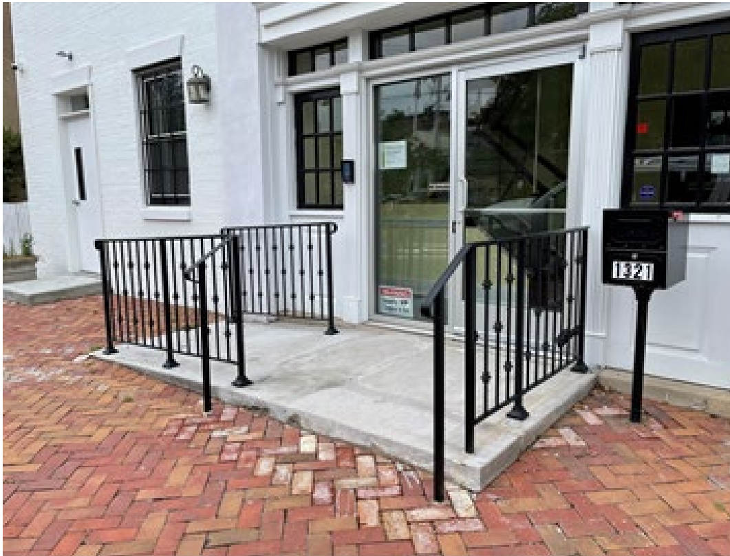
South Front Elevation showing encroaching ramp

Encroachment to allow an entry ramp to a daycare within the public right-of-way