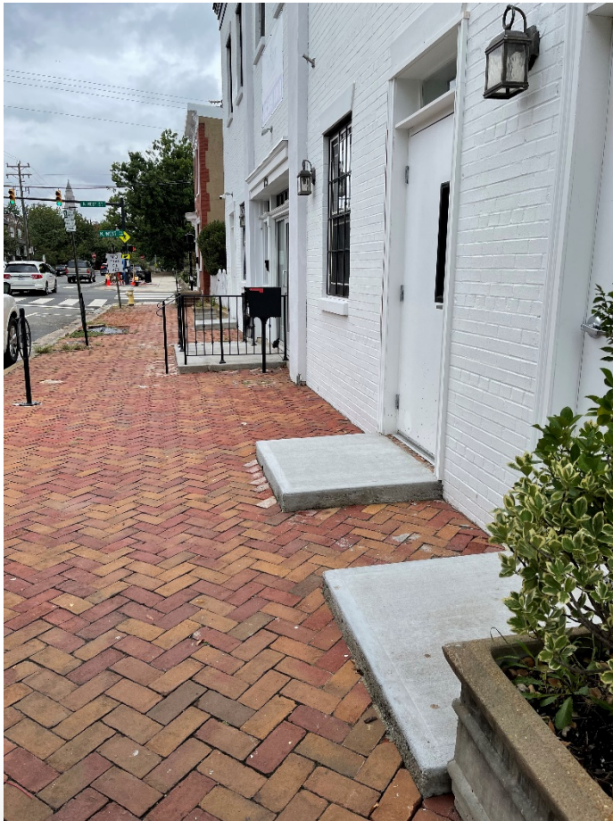
New landings that received BAR admin approval