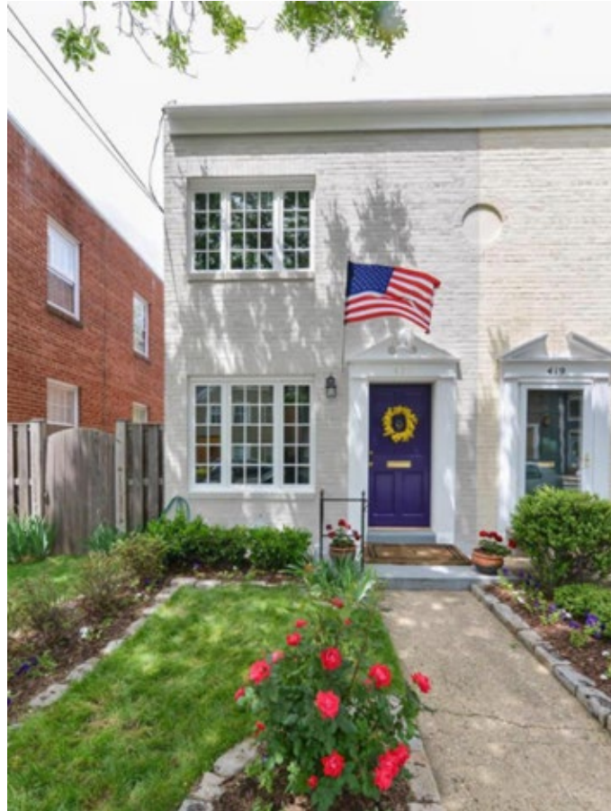
South Front Elevation

Encroachment to allow brick mitigation wall forward of the property line.