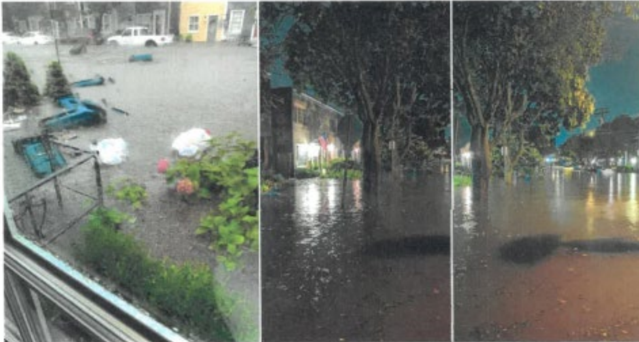
Before Renovation: May 2020