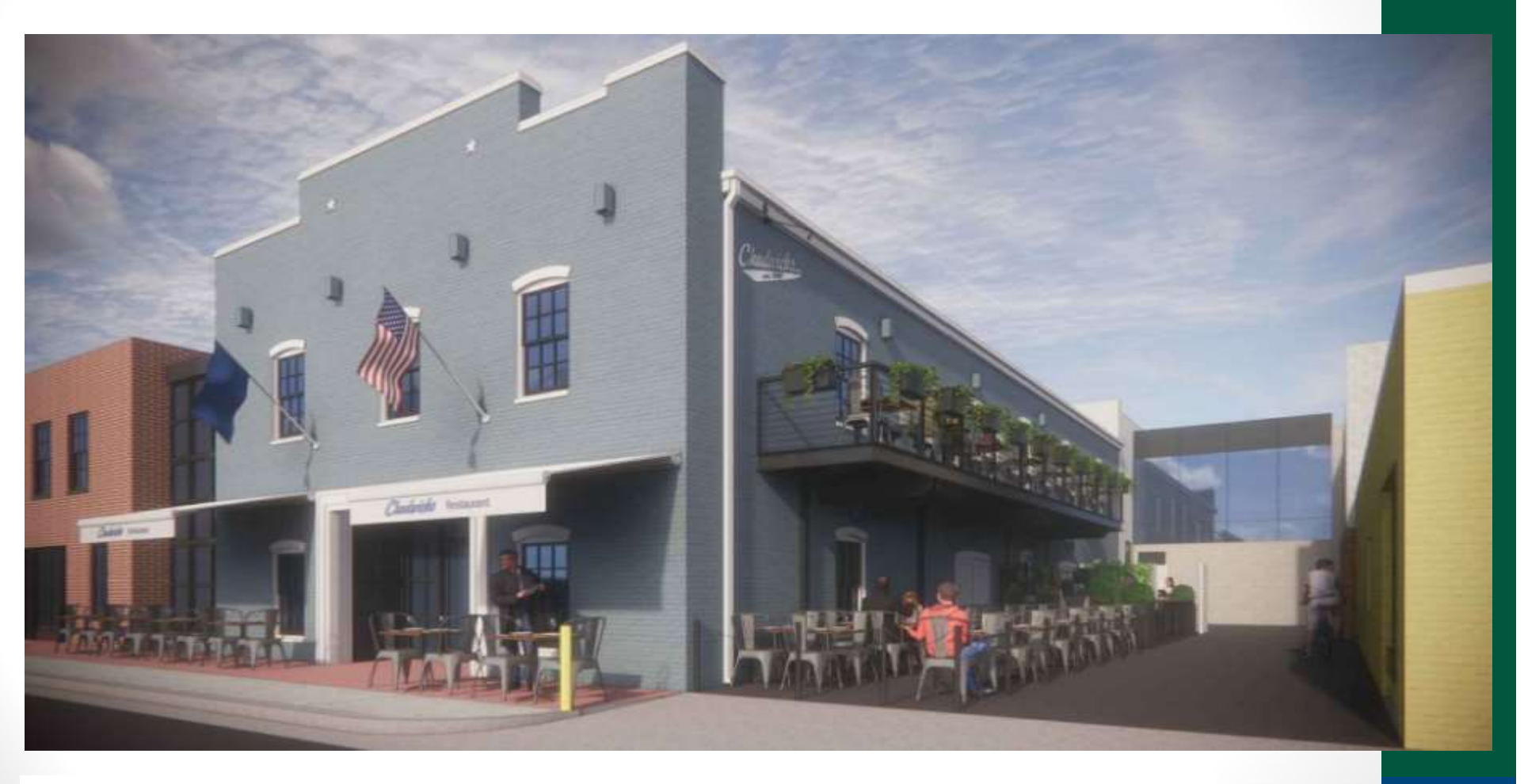
Figure 3: Proposed outdoor seating