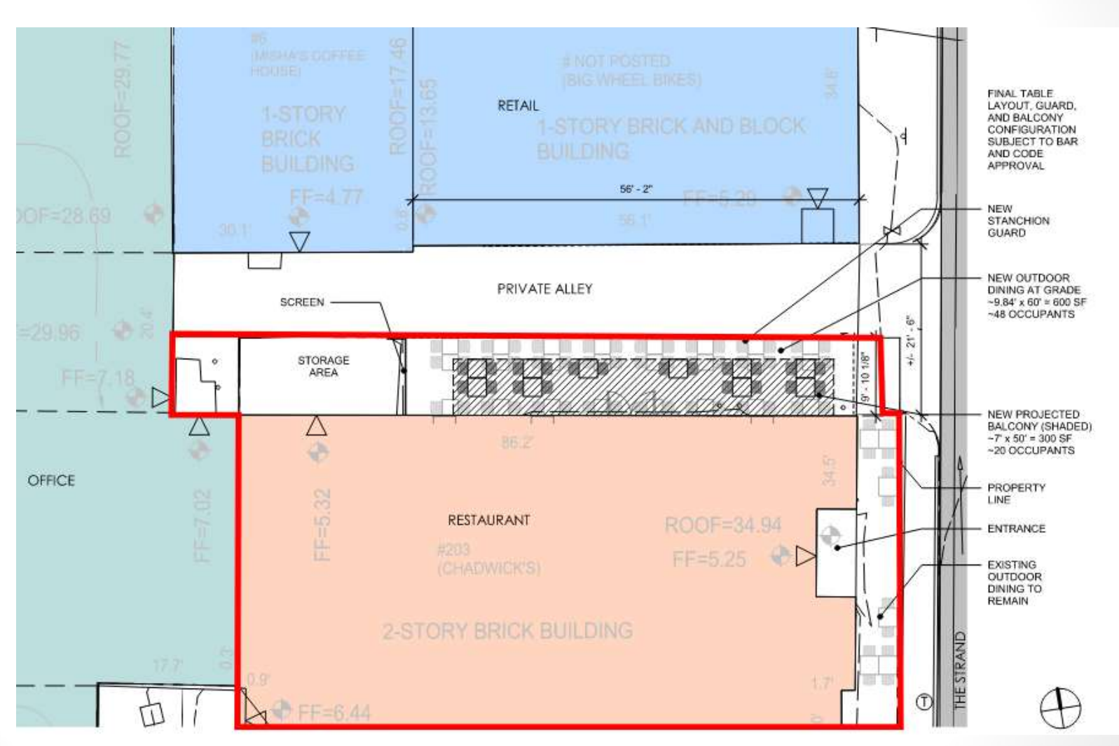
Figure 1: Site

SUP to add 70 outdoor seats to an existing restaurant.