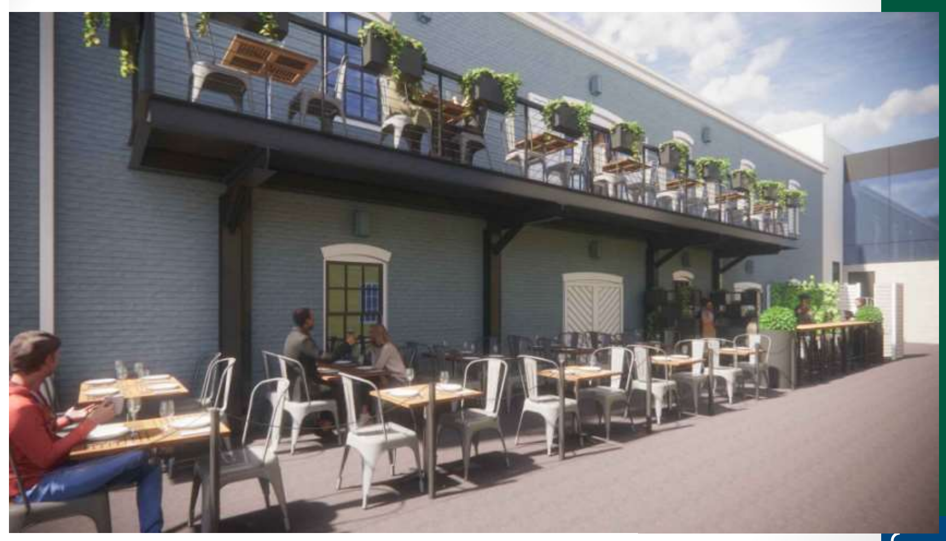
Figure 4: Proposed outdoor seating