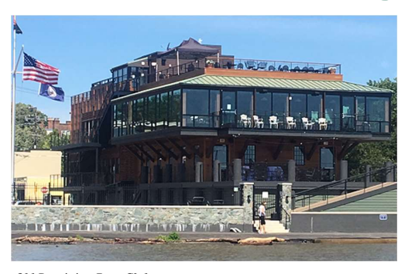
Old Dominion Boat Club