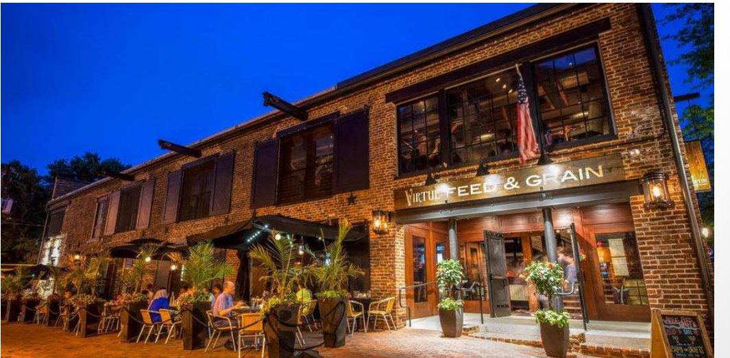
Virtue Feed & Grain