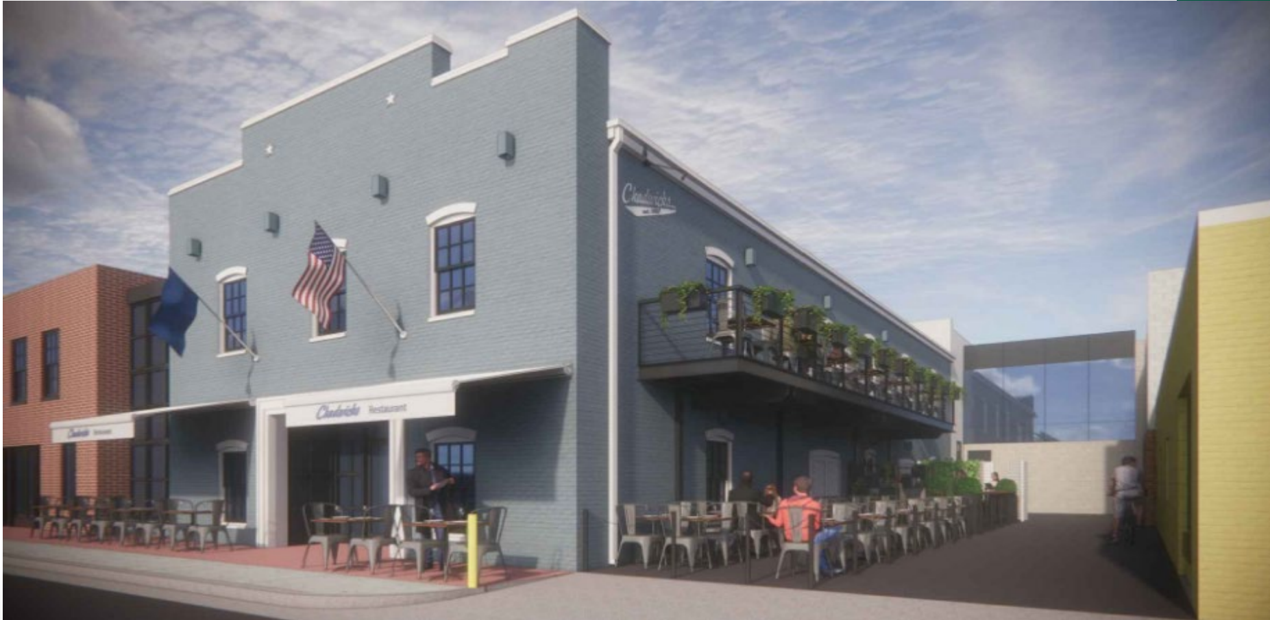
Figure 3: Proposed outdoor seating