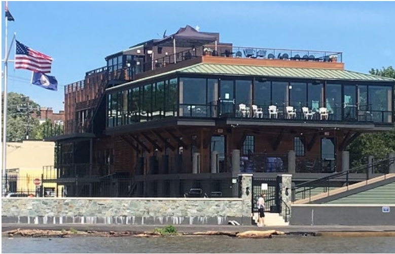
Old Dominion Boat Club