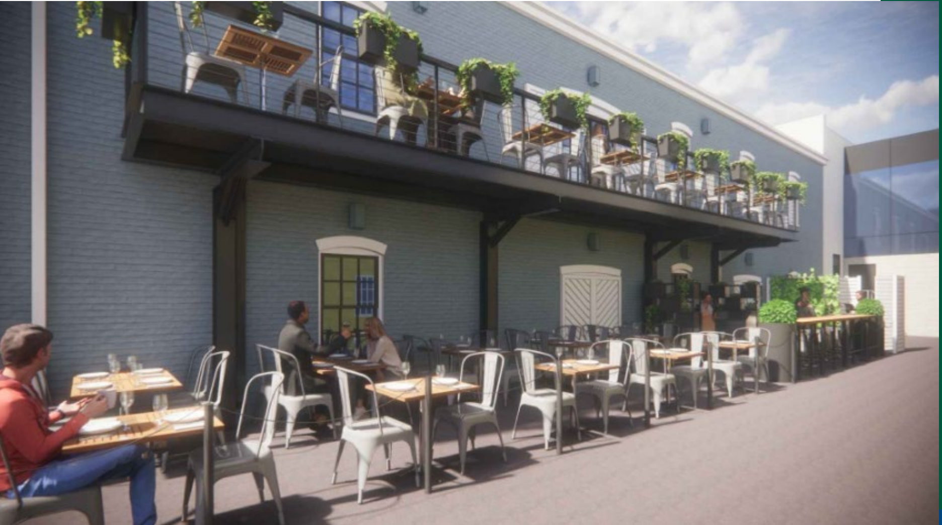
Figure 4: Proposed outdoor seating