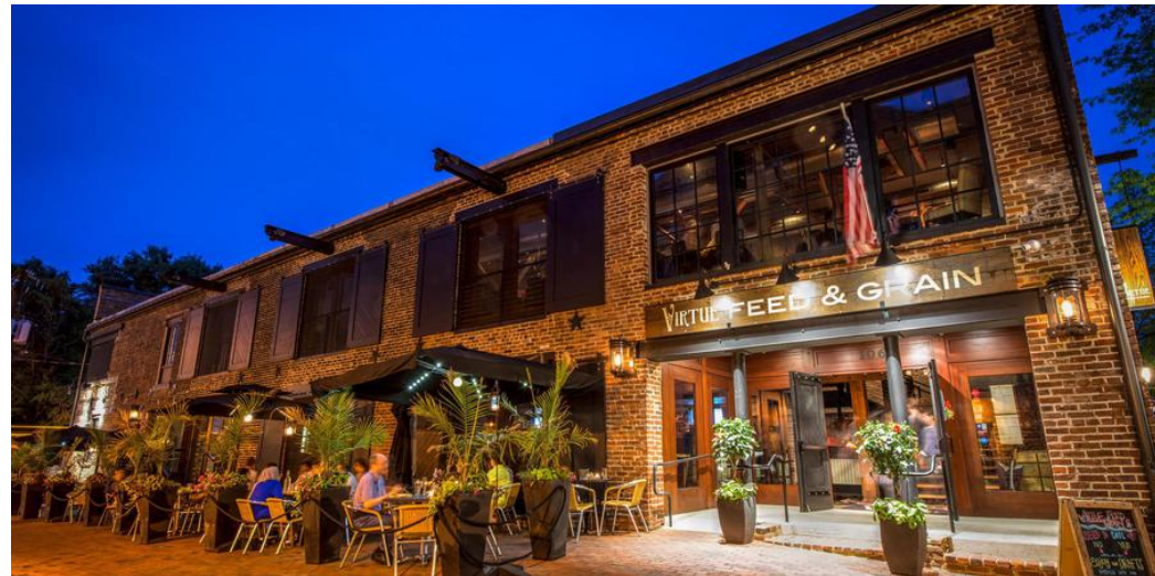
Virtue Feed & Grain