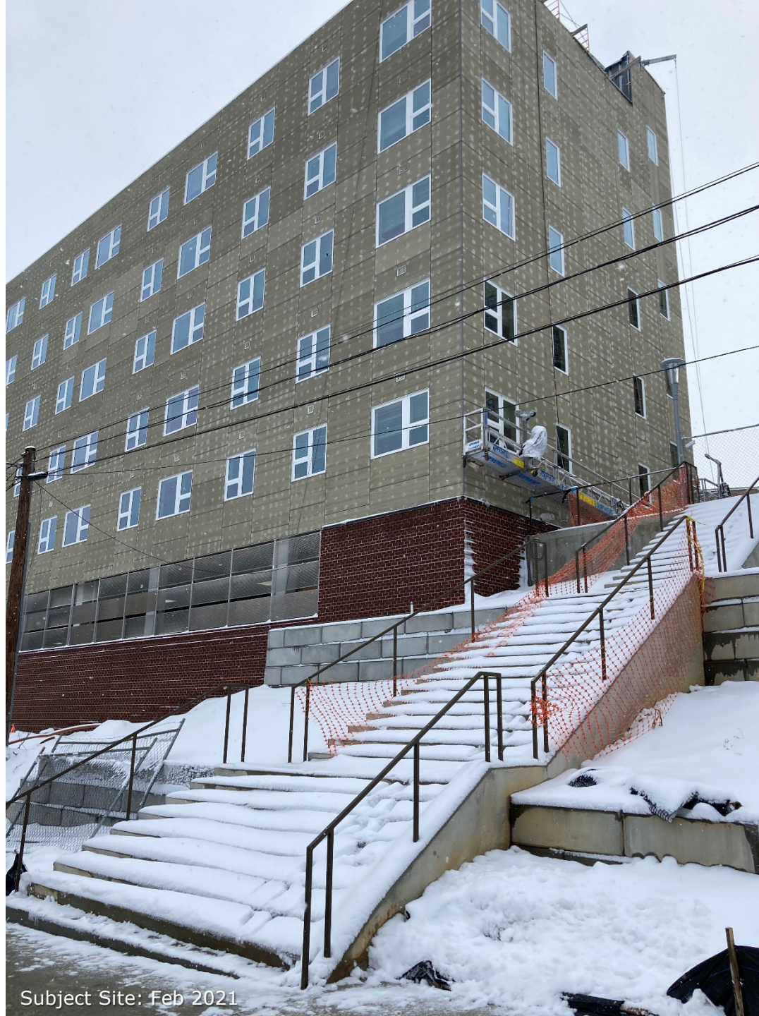
Subject Site: Feb 2021