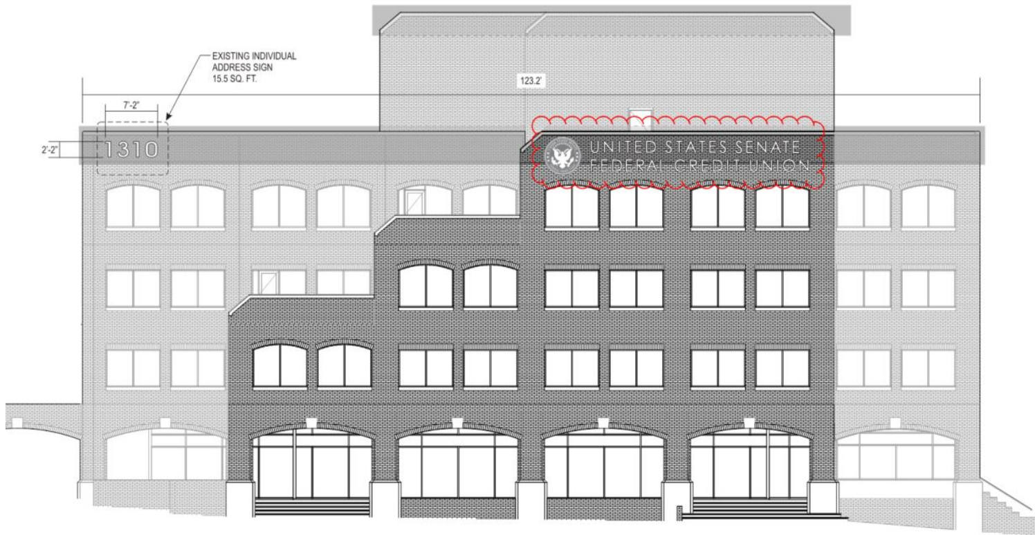
1 WEST ELEVATION VIEW SCALE: 3/32" = 1'-0"