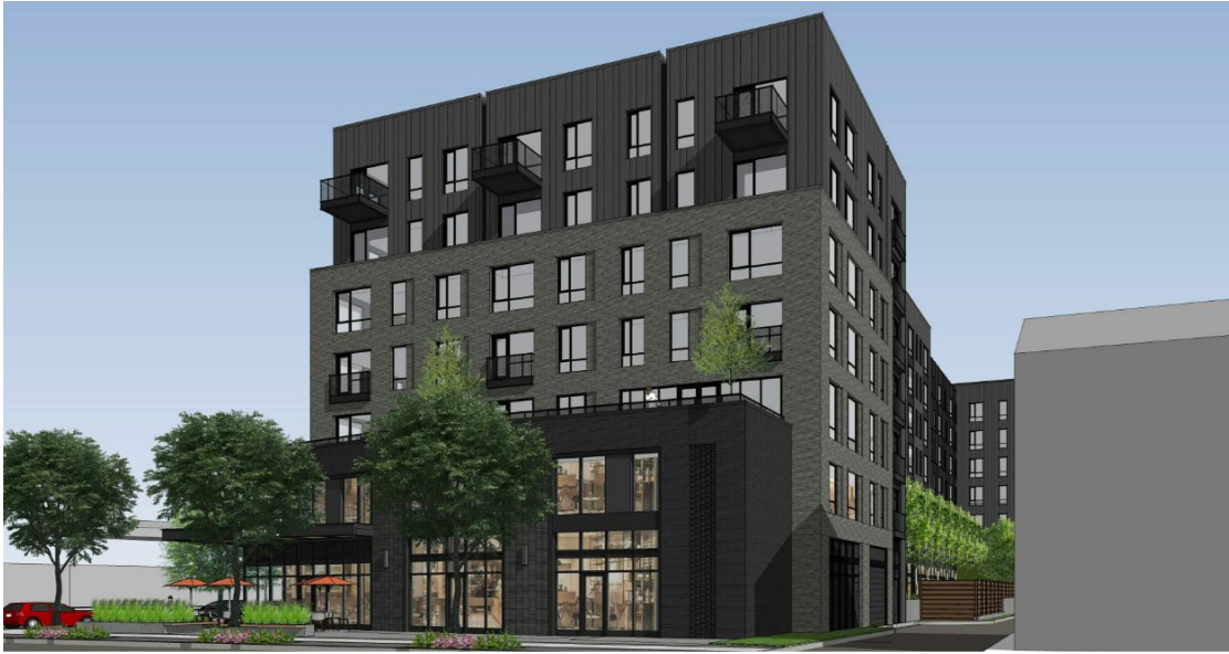
Wythe Street Elevation