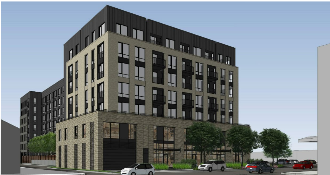
Madison Street Elevation