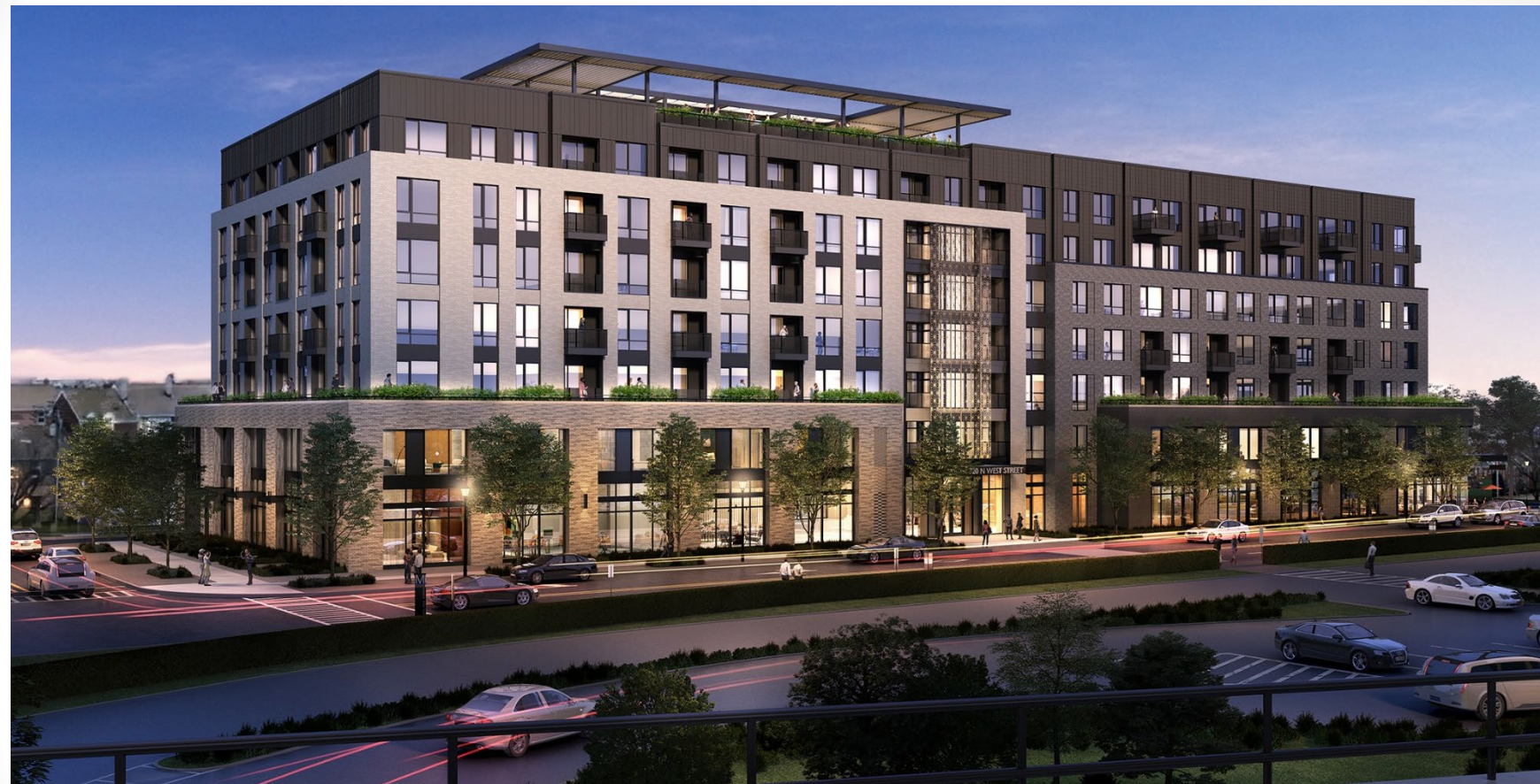
View from Metrorail Platform