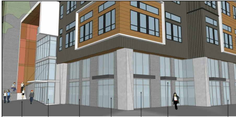
Front Entrance / Corner Illustrations