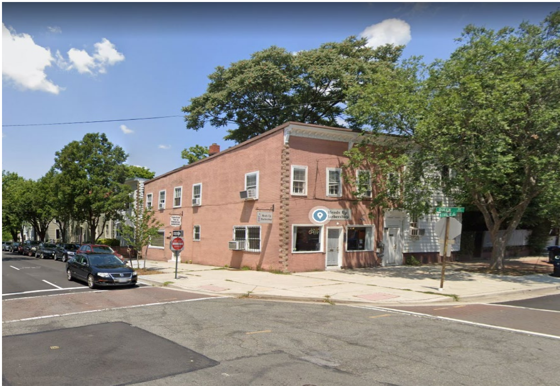
Figure 1: The subject rooming house occupies the second floor of the building.

A mix of residential, religious institution and commercial uses surrounds the subject building. Single family dwellings abut the rooming house to the north and west.