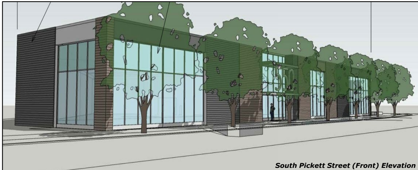
South Pickett Street (Front) Elevation