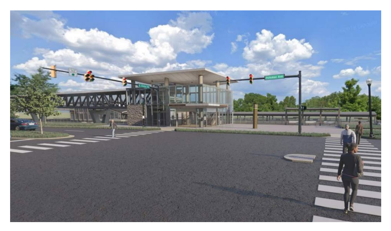
Graphic #3: South Access Pavilion looking north to North Potomac Yard (Innovation Campus)

Graphic #2: South Access Pavilion as seen from E. Glebe Road looking east across Potomac Avenue