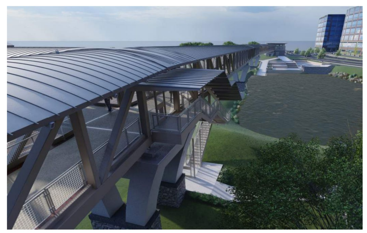
Graphic #4: Emergency Egress Stair and Bridge connecting to South Access Pavilion

<u>Graphic #5:</u> Interior of Bridge at the Knuckle Pier looking towards the South Pavilion – Egress stair at right