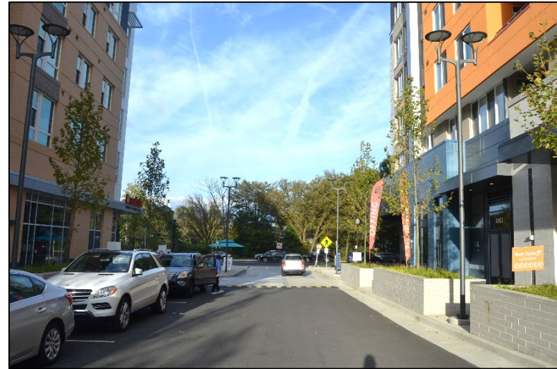
Private Street Berkeley