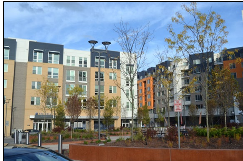
Public plaza with The Array & The Nexus beyond