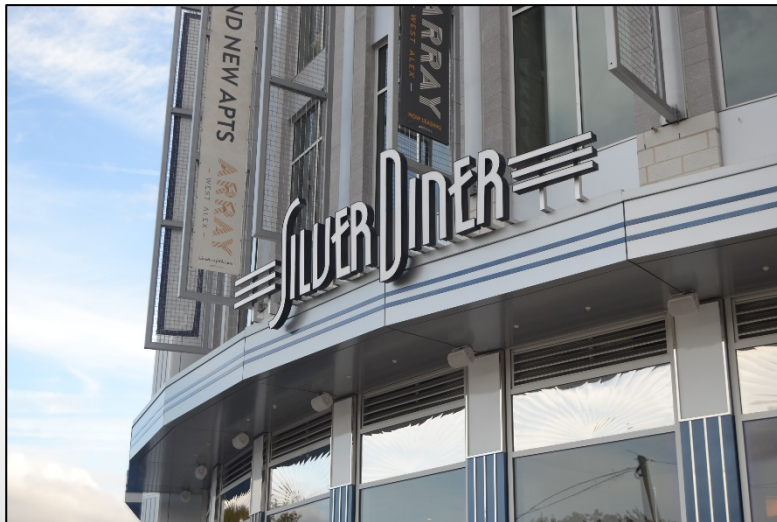
The Silver Diner