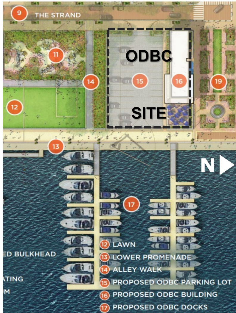
OLIN Waterfront Schematic Landscape Plan