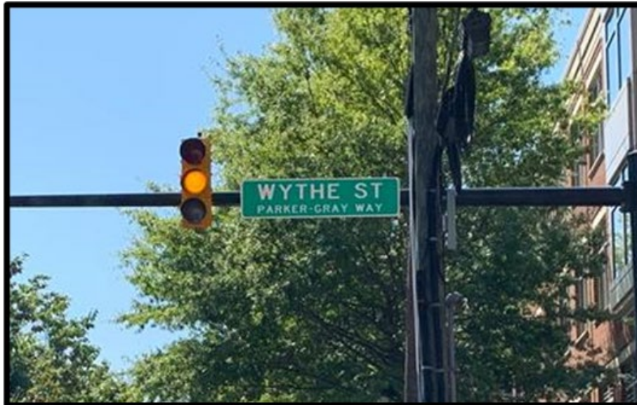
Figure 2. Example of “honorific” street naming sign.

An honorific street name would involve the addition of signage but would not change the mailing addresses for lots along the block. An honorific street name is included below the original street name on the sign as depicted in the example below (Figure. 2).