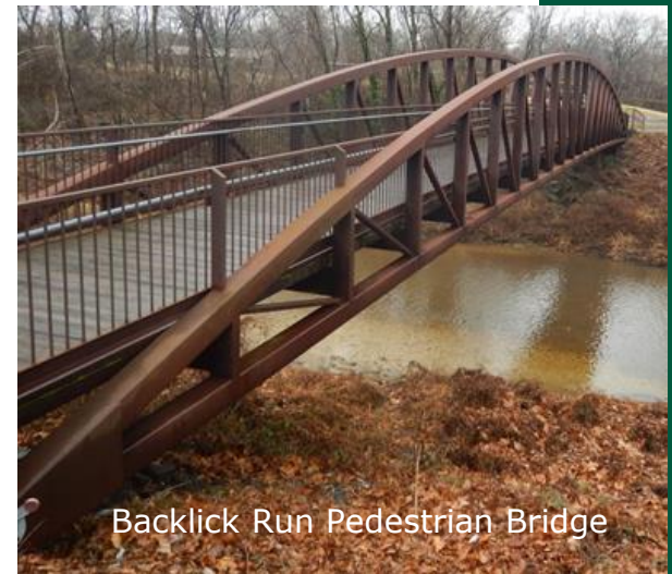
Backlick Run Pedestrian Bridge