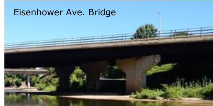
Eisenhower Ave. Bridge