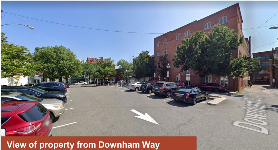
View of property from Downham Way