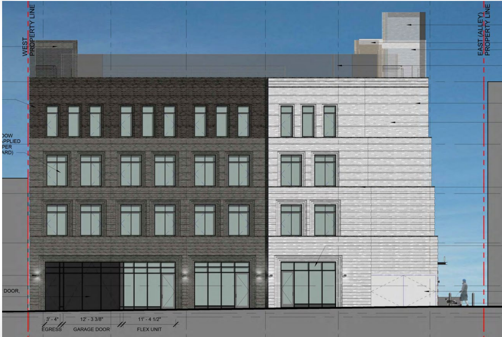
Downham Way (South) Elevation