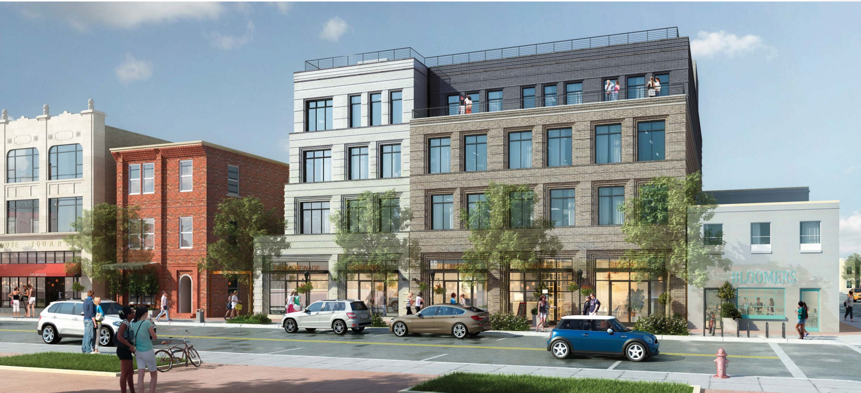
King Street (North) Elevation