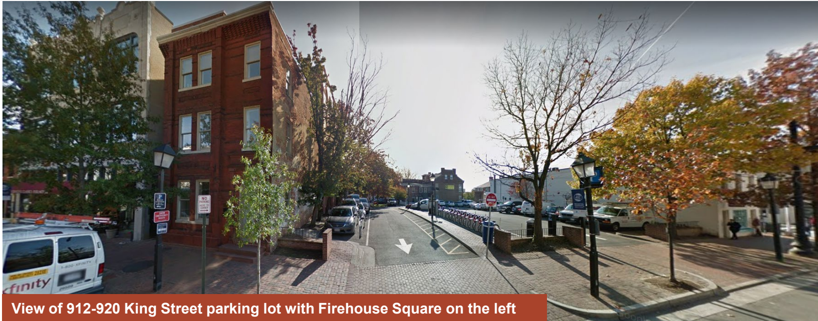
View of 912-920 King Street parking lot with Firehouse Square on the left