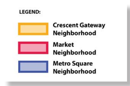
Figure 3.3: North Potomac Yard Neighborhoods