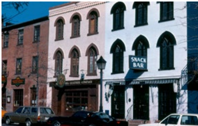
Figure 1: March 1985 Photo

According to Ethelyn Cox in her book Historic Alexandria Virginia Street by Street , the three-story buildings in the one hundred block of King Street (north side) date from the late 18 th to the early 20 th century and were originally constructed as warehouses. A photo from 1985 (Figure 1) shows that the front façade has changed relatively little in the last 50 years. Note that there was previously an awning on this façade.