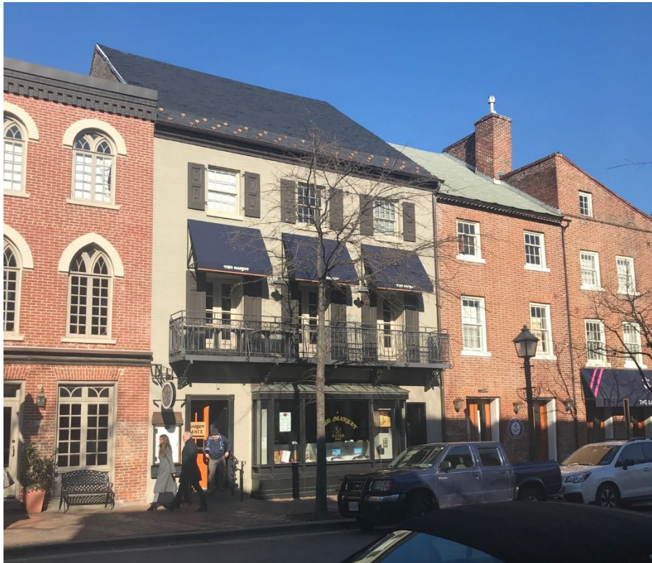
Figure 2: Awnings Approved by the BAR

The applicant now seeks to add a similar awning over the first-floor double doors to visually unite the buildings that the restaurant occupies and draw attention to the doors that will be the main entrance to the restaurant. The applicant has worked with staff to design a simple, compatible, shed form awning that unifies the two storefronts. Staff recommends that the awning be reduced in width by approximately four-to-six inches on either side so as not to crowd the brick jack arches over the adjacent storefront windows.