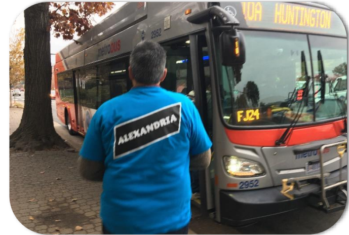
Proximity to Job Centers