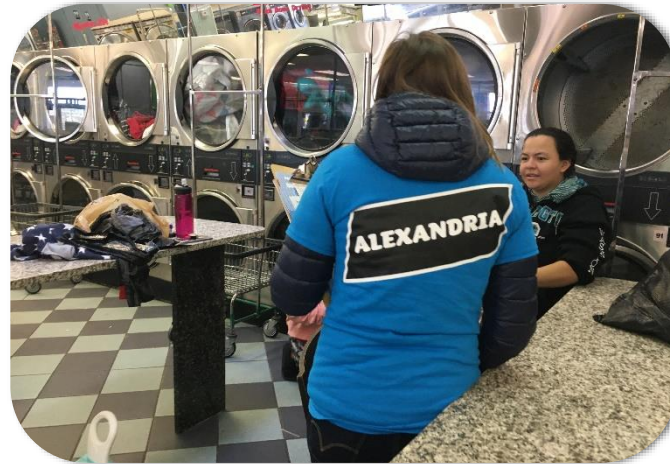
Calm, Small-Town Feel