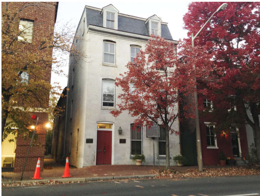
Figure 1. 1315 Duke Street, front elevation.

1315 Duke Street includes the Freedom House, an 1812 brick building that served as the headquarters and slave pen of the largest slave trading firm in the United States in the first half of the 19 th century. The building possesses both local and national significance related to the buying and selling of enslaved persons. The building was once part of the headquarters for the largest domestic slave trading firm in the United States. From 1828 to 1861, five successive firms forced as many as 50,000 enslaved adults and children from the Chesapeake Bay area to the slave markets in Natchez, Miss., and New Orleans by foot or ship. The property was designated as a National Historic Landmark in 1978, a designation reserved for resources that represent an important aspect of American history and culture. The property was purchased by the Northern Virginia Urban League in 1997 and has functioned as a small museum with office and program space for the organization since then. The lot fronts onto Duke Street and has rear access via a public alley. City Real Estate records state that the 1315 Duke Street lot has 2,937 square feet.