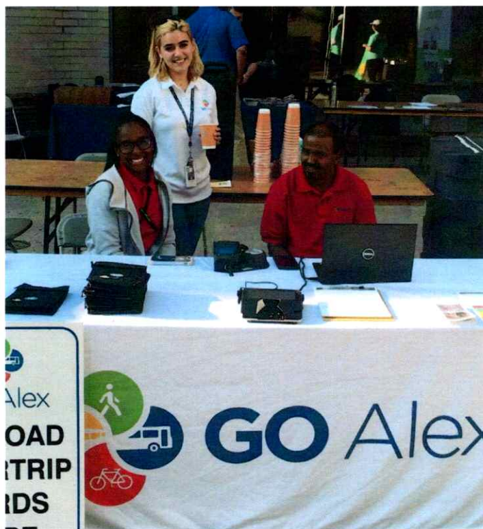
Figure 2 -- GO Alex Mobile Store team (center) and a GO Alex staffer

The Mobile Store is GO Alex's commuter services arm, helping commuters and those who wish to use alternative transportation options. The Store uses a GO Alex branded van to sell fare media at a number of locations, including each of the City's Metrorail stations, and popular tourist destinations.