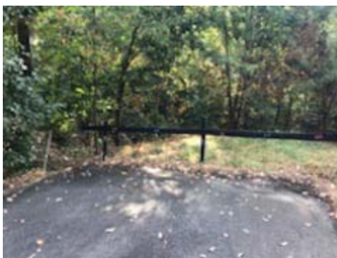
Unfinished 1101 Lot Appearance

Request. Accordingly, the HOA requests that the extension be granted only with a modification requiring professional landscaping and finishing of the undeveloped lot. Specifically, the HOA would request that an appropriate decorative fence or wall be erected, that an appropriate stand or screen of trees be professionally planted, and the area be appropriately landscaped in a manner to be approved by the Commission and/or the Pickett's Ridge Homeowners Association.