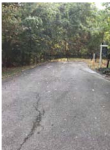
Sample Roughness/Cracks in Paving

Request. The HOA submits that Finley Lane in its entirety should be refinished and repaved, with appropriate decorative fencing and an appropriate landscaped entryway to be completed by the applicant with the advance approval of the Commission and/or the Pickett's Ridge Homeowners Association.