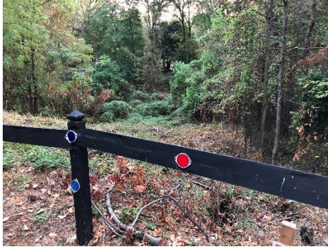
Condition of the Street End Drop-Off

Request. The HOA would request that a professionally installed fence or wall that is attractive and approved by the Commission and/or the Pickett's Ridge Homeowners Association also be required. Such a fence should be both functional in terms of safety and attractive in landscaping.