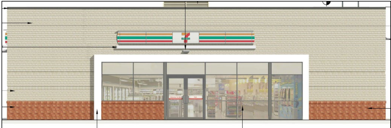
Figure 2: Edsall Road Elevation (North Elevation)