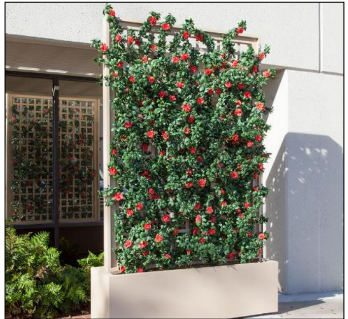
Figure 2: Zoning Ordinance definition of a trellis

Section 7-202 of the Zoning Ordinance permits certain permitted obstructions within a required yard, which includes trellises. While these structures are permitted within yards, the Zoning Ordinance does not currently provide clarity on the design and form on what types of structures may be considered a trellis. This definition seeks to codify on-going staff interpretation on the design of a trellis, which staff proposes to define as a structure made of interwoven pieces of wood, metal, or synthetic material that is a minimum of 80% open to support and display climbing plants.