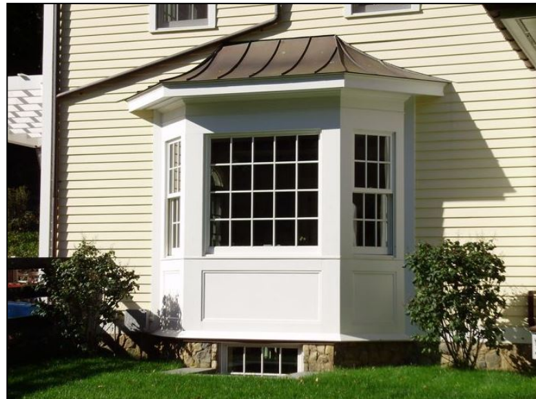
Figure 1: Zoning Ordinance definition of a bay window

Section 7-202 of the Zoning Ordinance allows certain permitted obstructions within a required yard, which includes bay or display windows, projecting 20 inches or less into the required yard. While bay windows are permitted within yards, the Zoning Ordinance does not currently provide clarity on the design and form on what types of structures may be considered as bay windows as opposed to bump out additions. This definition seeks to codify ongoing staff interpretation on the design of a bay or display window, as defined within certain architectural publications. Staff proposes to define bay or display windows as a series of windows projecting from the outer wall of a building where such space shall have a minimum of 65% of the surface area composed of glass. Other similar structures that may not meet this new definition would be considered bump out additions and would be required to meet the yard requirements of the respective zone where it would be located.