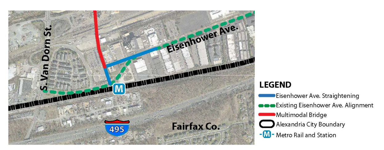
Figure 4: Realignment of Eisenhower Avenue

The EW Plan proposes that Eisenhower Avenue, between the Covanta facility and Metro Road, be straightened to create a new pedestrian-oriented street with a realigned configuration (Figure 4) that enables a mixed-use destination around a redeveloped Van Dorn Metrorail Station. This would be constructed in conjunction with redevelopment of the WMATA property and adjacent sites.