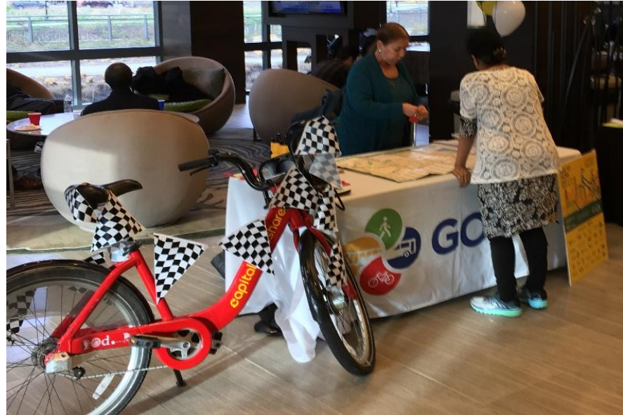
Working the Parc Meridian commuter fair