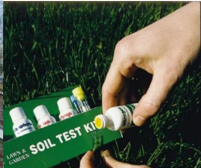
Urban Nutrient Management