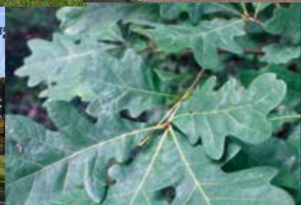
Native Tree Planting