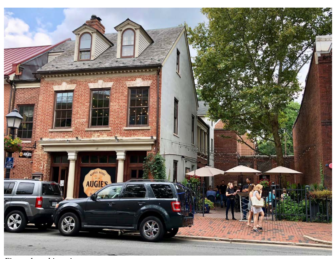
Figure 1 - subject site

The subject site contains two lots of record with a total of 49.4 feet of frontage on King Street, 84.2 feet of depth and a lot area of 4,158 square feet. The 1106 King Street lot contains a two-and-a-half story structure that houses an existing 108 seat restaurant. The 1108 King Street lot, located immediately adjacent to the west, contains a brick patio that accommodates an accessory outdoor dining area with 45 seats. Figure one, below, shows the restaurant building and adjacent patio.