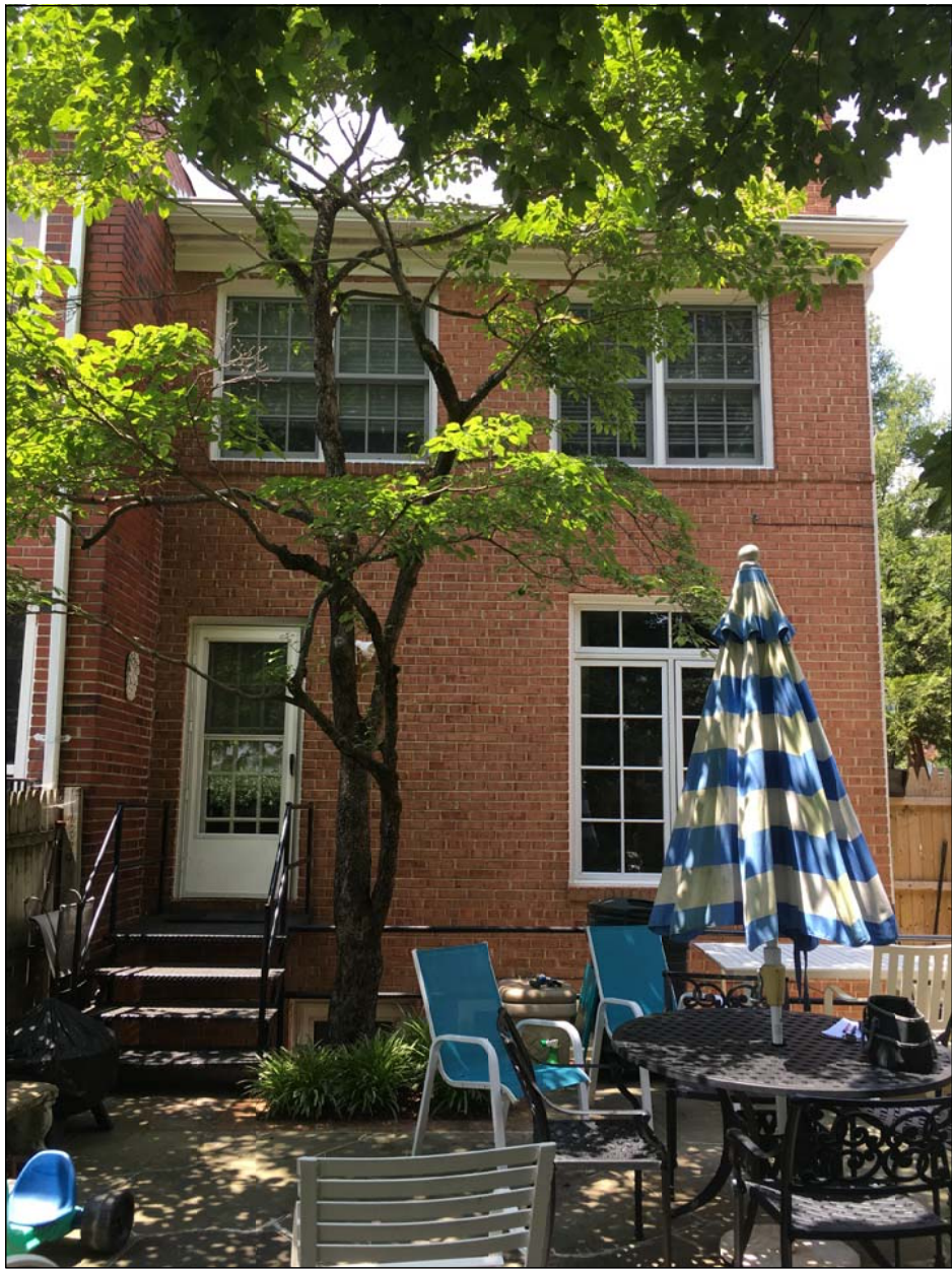
existing rear elevation