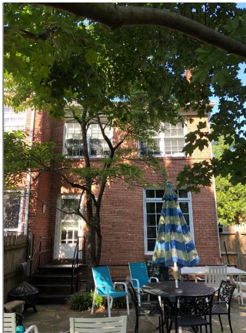
Figure 1: Existing east elevation, not visible from the public right-of-way.

820 South Fairfax Street is a three-bay end unit rowhouse constructed of common bond brick. The property was constructed in 1953 as part of the Yates Garden subdivision. Sanborn Fire Insurance Map research does not show a property existing in this location prior to the construction of the subject property.