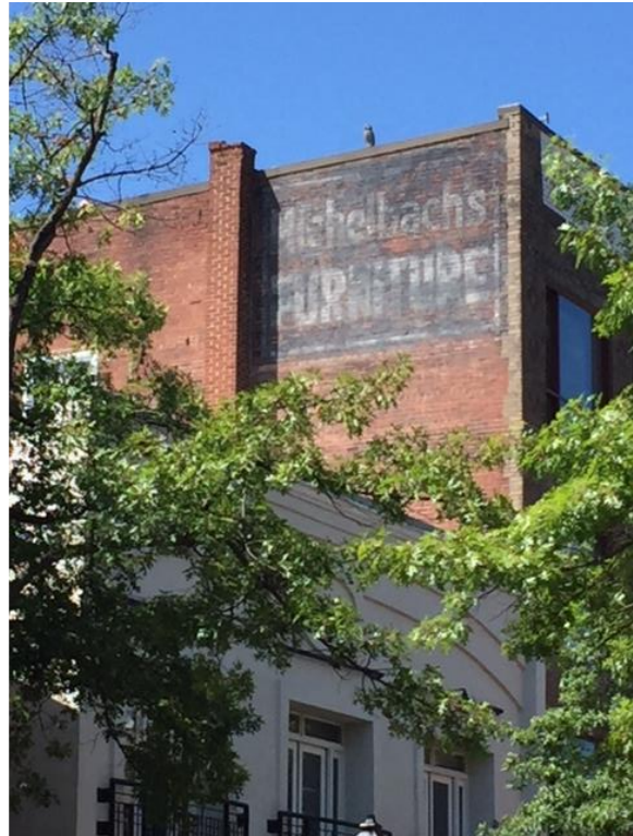
Figure 1. East elevation depicting existing chimney and ghost sign.

In this case, the brick chimney appears to be a later addition and not integral to the overall design of the building or a character defining historic feature and appears to be located on the abutting neighbor's property. Staff has no objection to removal of this later element. It is structurally independent of the building and is not currently being used. Its removal will potentially improve the visibility of the historic painted wall sign that serves to recall the former use of this building.