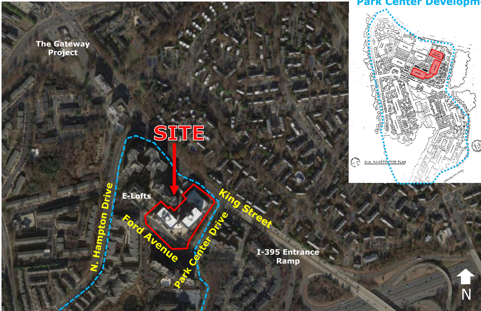
Park Center Development