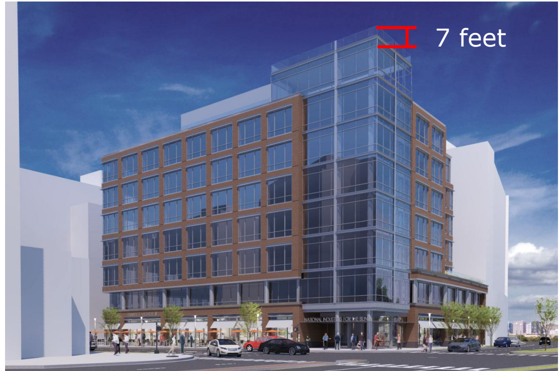
Looking north at the southeast corner of the building