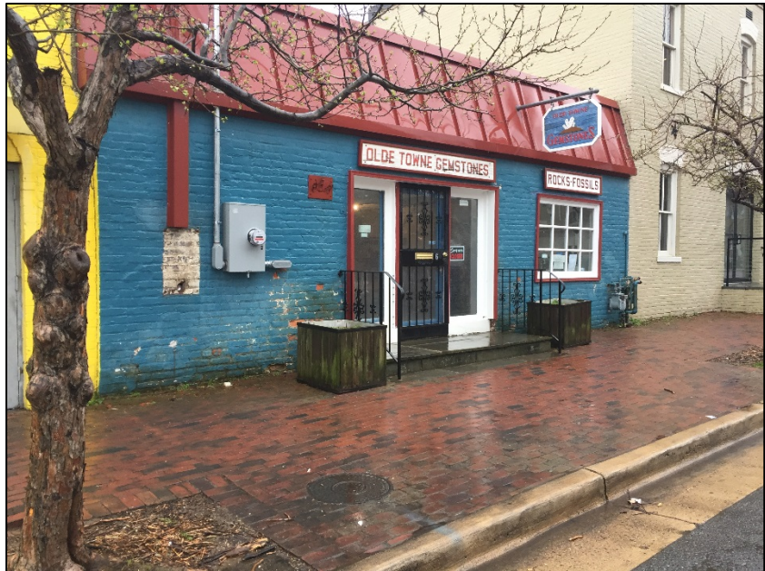
Figure 1: The subject site

The subject site is surrounded by commercial uses including Big Wheel Bikes to the east, Chadwicks to the southeast, the Old Dominion Boat Club to the east, small offices to the west, and the Strand Building to the north which houses multiple commercial uses. Though not immediately adjacent, residential areas are nearby on the 100 block of Prince Street.