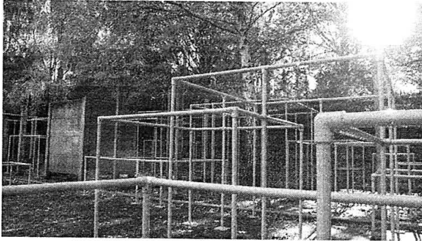
1. "Rail Heaven" - Copenhagen, Denmark