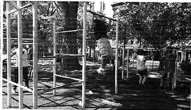
2. Tompkins Square Park - New York City