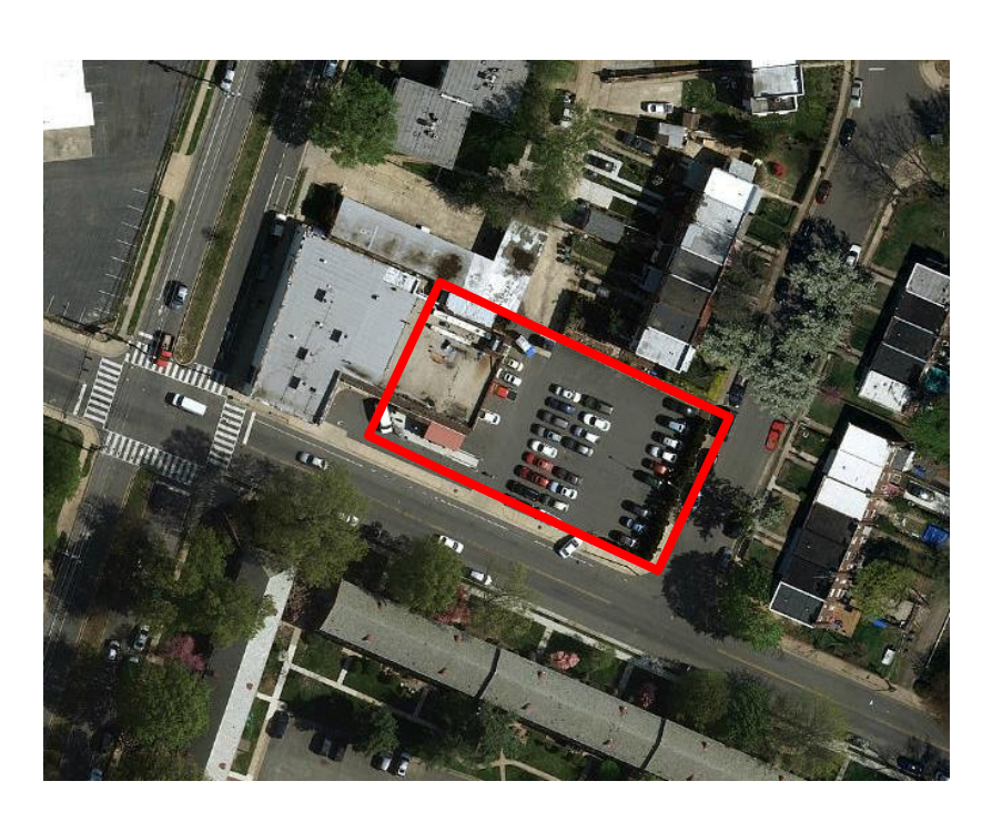
The subject restaurant, and parking lot, outlined in red.