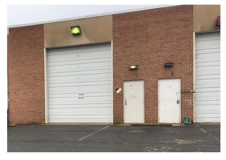
5430 Eisenhower Ave