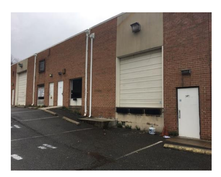
Main entrance at 5412 and 5412 A Eisenhower Ave