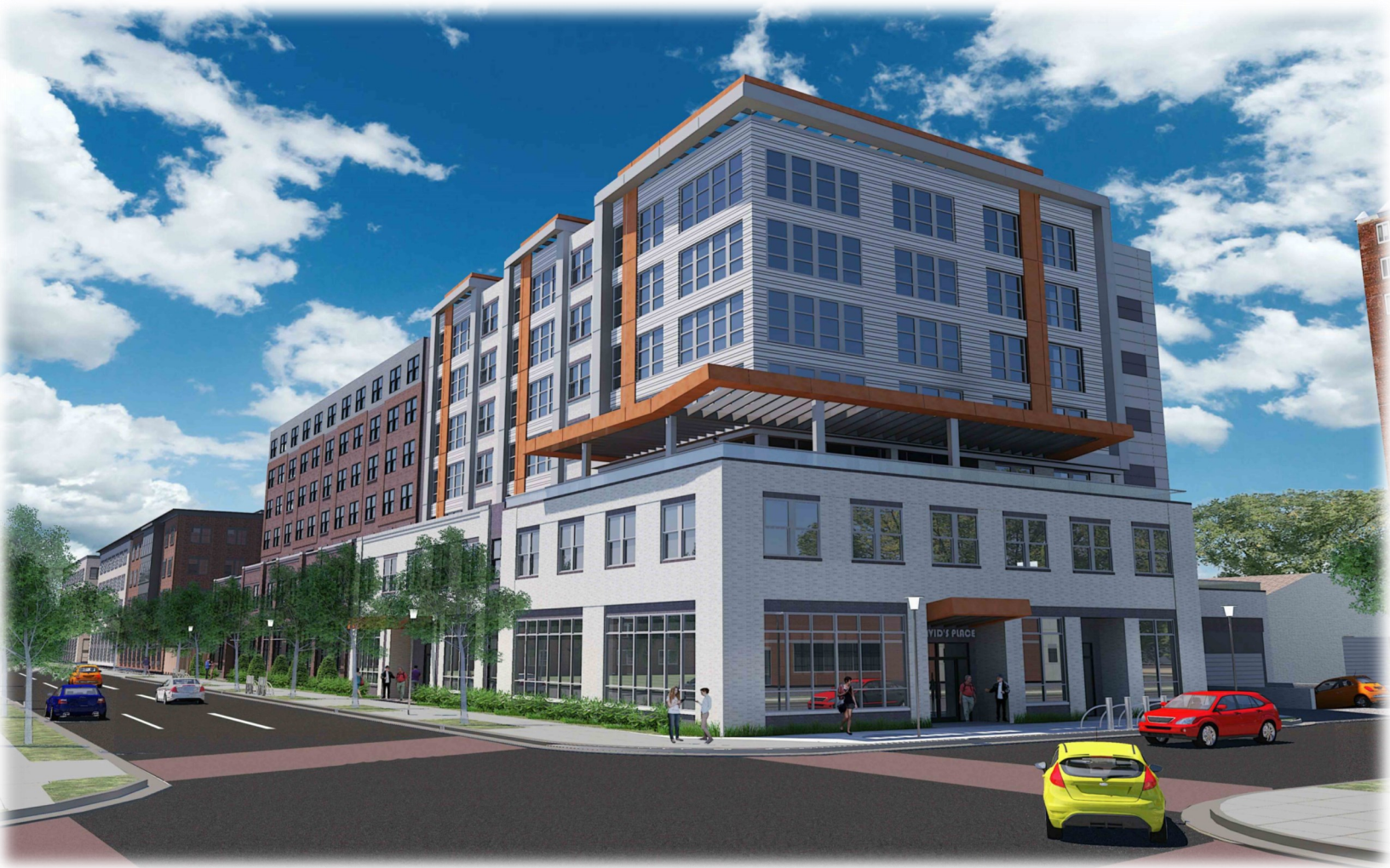
AHDC Carpenter's Shelter Redevelopment Project