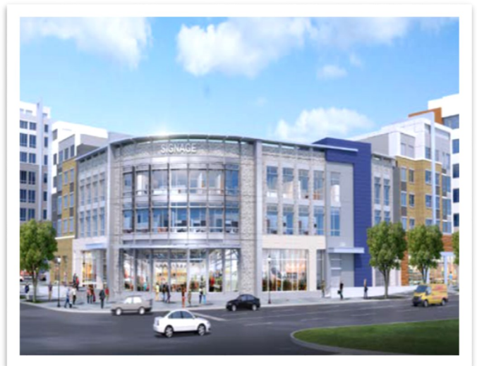
The Gateway at King and Beauregard Affordable Housing Project