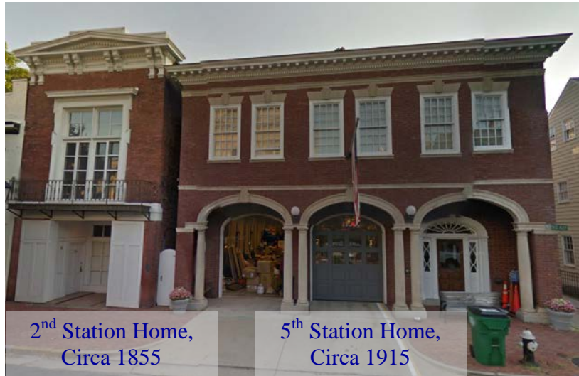
Figure 4: The second and fifth homes of the Relief Society Fire Company, constructed circa 1855 and 1915, respectively.

Fire Station 201 was constructed directly adjacent to the second home of the “Relief Society Fire Company,” a Victorian building constructed in 1855 that is the oldest standing station building in the City of Alexandria. The historic 1855 fire station was converted to a residential use in 1980.