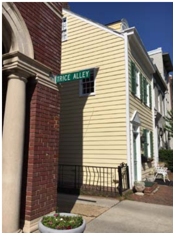
Figure 2: Trice Alley

The subject alley is located within the 300 block of Prince Street and extends north from Prince Street, between S. Royal and S. Fairfax Streets. The public alley of poured concrete runs approximately half a block in length for approximately 220 feet and varies in width from 8 to 18 feet. The alleyway is adjacent to Fire Station 201, located at 317 Prince Street, which is home to Engine 201. Fire Station 201 was constructed by the City of Alexandria in 1915. The eastern boundary of the alleyway is framed by a two-story, single-family home that was built circa 1920 and is listed as a contributing historic structure in the City of Alexandria.