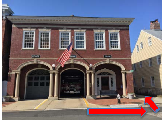
Figure 1: Historic Fire Station 201 and Trice Alley.