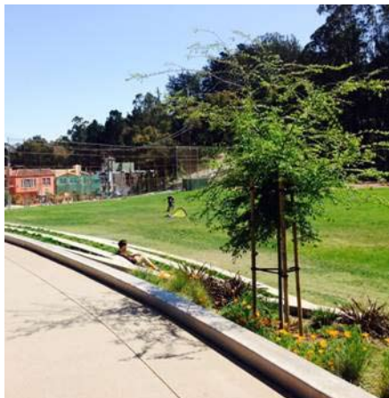
The image (left) from a San Francisco park shows an example of stairs serving as spectator seating as proposed between the sport courts and open field space.