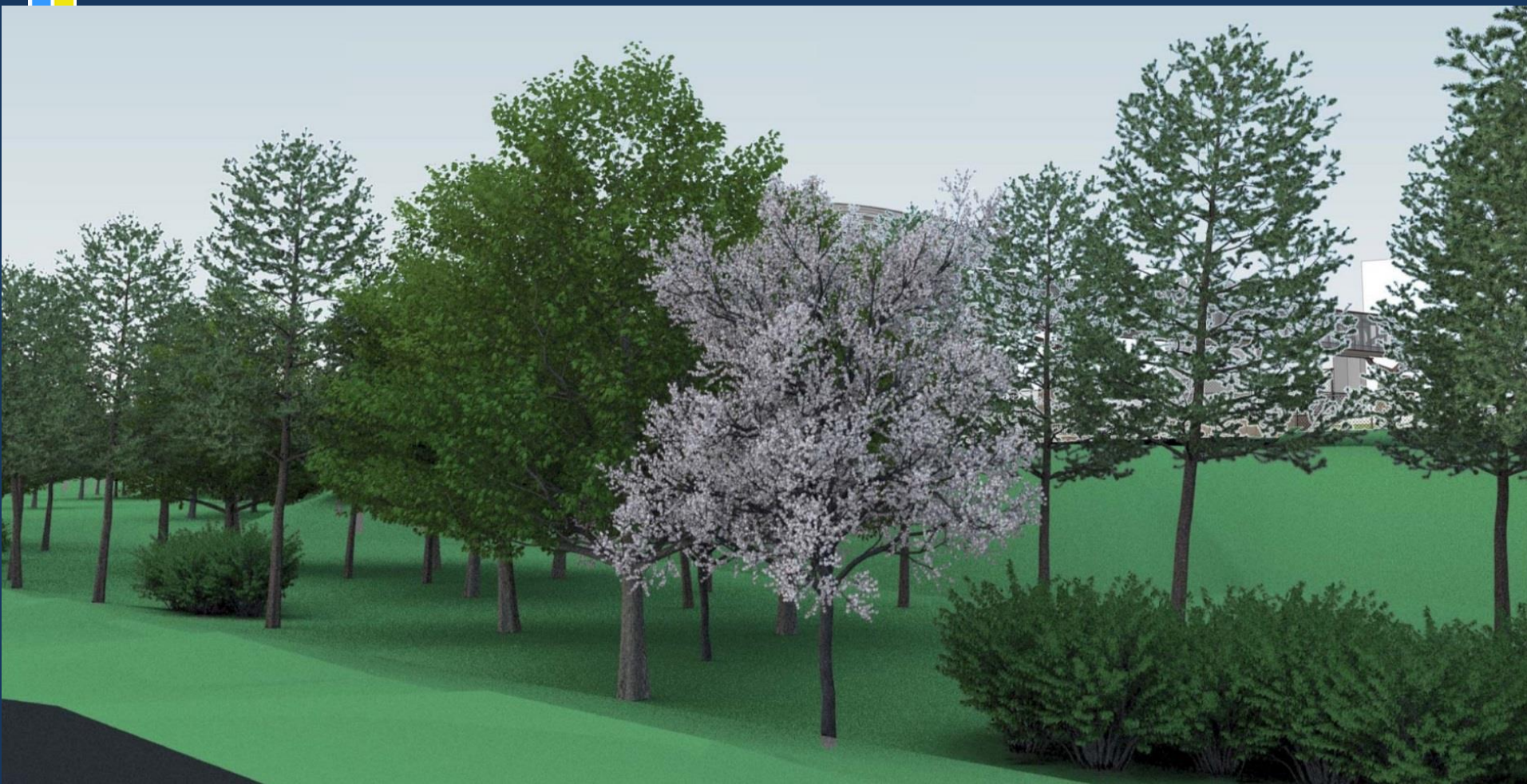
View from Parkway Southbound Lane with Landscape