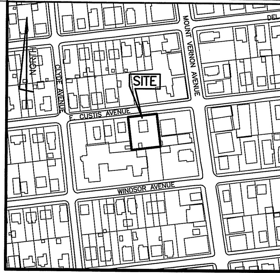
VICINITY MAP SCALE: 1" = 500'