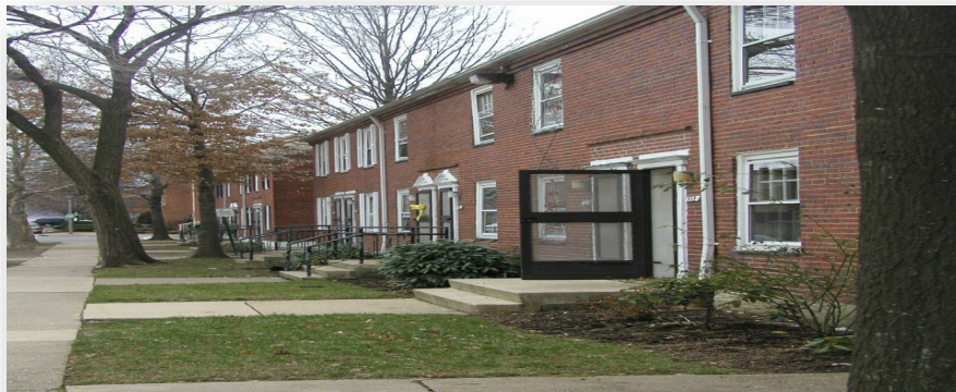
ARHA - Hopkins —Tancil Court