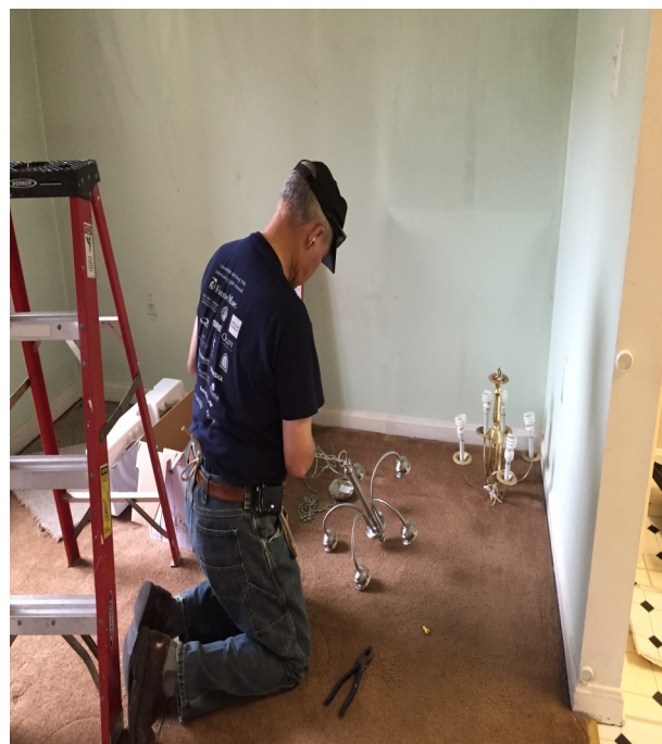
The City and Rebuilding Together Alexandria collaborate in acquiring and rehabilitating foreclosed properties for sale to eligible first time homebuyers under the City's ANSP program.

In City FY 2017, Office of Housing staff will coordinate and present public education programs to improve public awareness and promote compliance with fair housing laws. In addition to an annual seminar for apartment managers, Office of Housing staff conducts on-site fair housing training for real estate and property management professionals. This training is provided as a free service to businesses operating in the City.