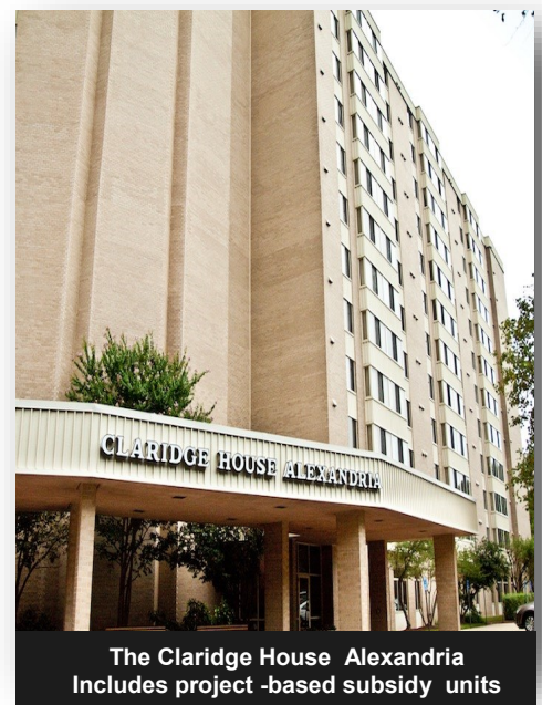
The Claridge House Alexandria Includes project -based subsidy units

There are currently 2,668 privately-owned rental units with project-based assistance for low-to moderate-income households. The City's five-year objective involving these units is to preserve and maintain these units, and to achieve a net increase in this number of units through investment of local funds and/or through use of non-monetary tools and strategies. However, affordability may be lost in some of these units as the private entities that own and operate these units can opt out of subsidy contracts that are due to expire. If this occurs, these units could be lost from the City's assisted rental housing stock. In FY 2017, 300 units at the Claridge House will have the option to opt out of a subsidy contract. The City will continue to proactively work with private owners to preserve affordable housing units, when possible, and will continue to identify resources to assist in preserving and expanding the supply of affordable housing for lower-income households.