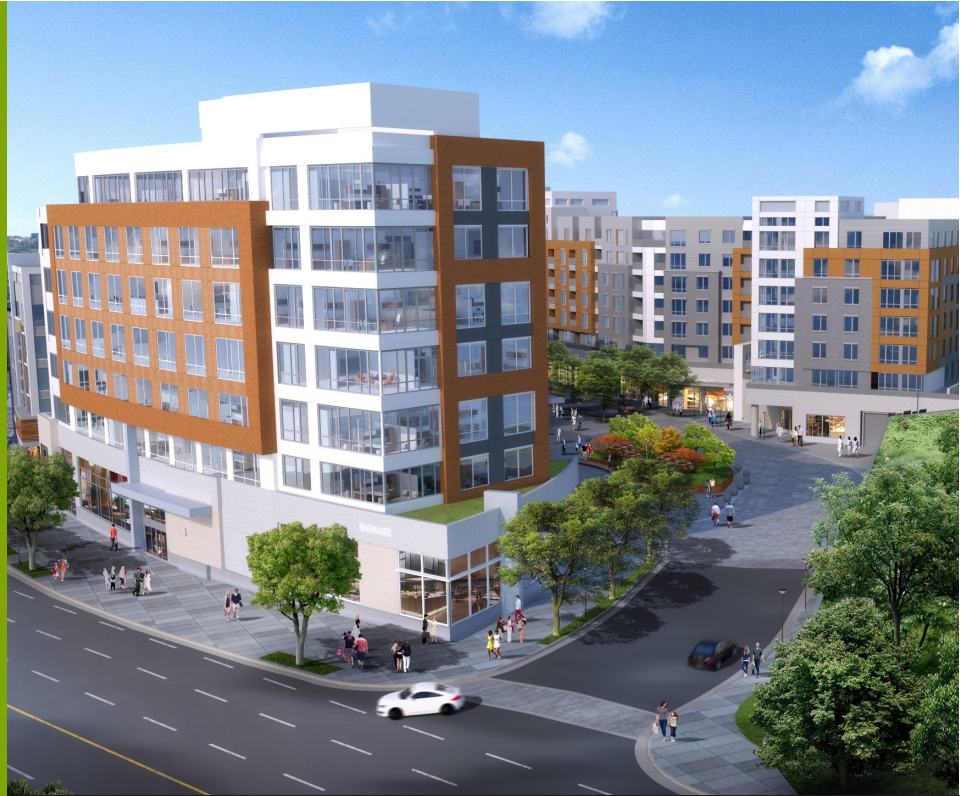
AHDC— Gateway at King Beauregard Future Development

While the affordability needs gap during the Consolidated Plan period is estimated to be around 14,000 units, based on the currently anticipated level of resources for affordable housing from federal, state, local, and/or private funds, Alexandria City Council has set a goal to achieve new affordability for housing units by 2025. The number of units the City expects to achieve yearly are noted in its annual Action Plans.