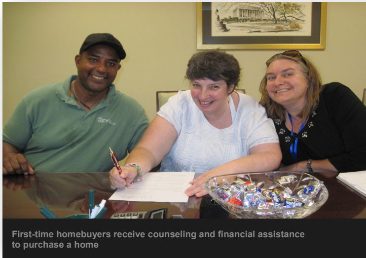
First-time homebuyers receive counseling and financial assistance to purchase a home

By Providing Affordable Ownership Housing Opportunities