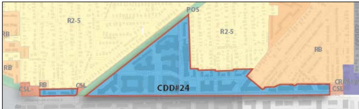
Revised Zoning Plan