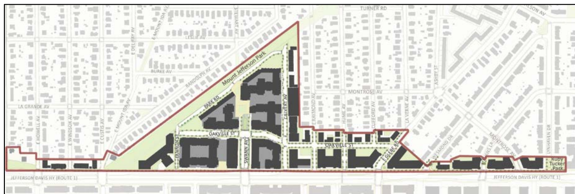
Revised Illustrative Plan