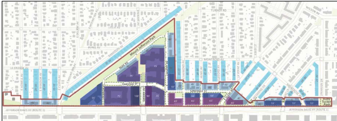
Revised Height Map