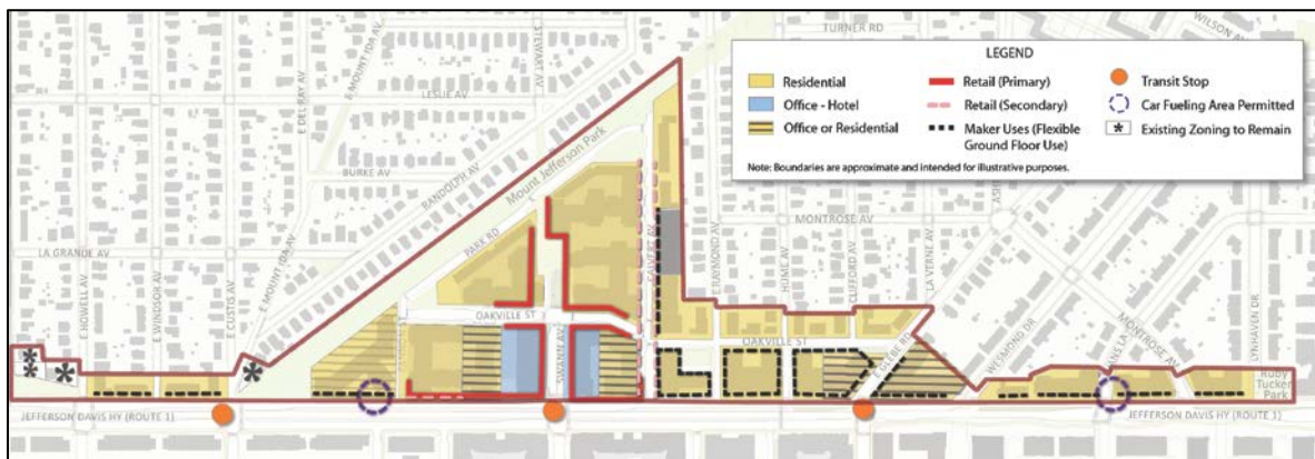
Revised Land Use Map