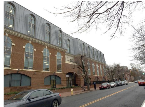
277 S. Washington Street, The Atrium Building