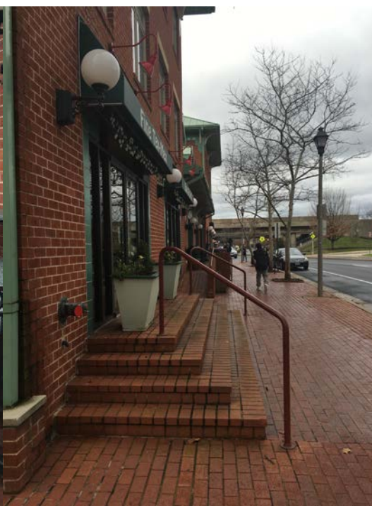
Figure 2: Area B existing conditions