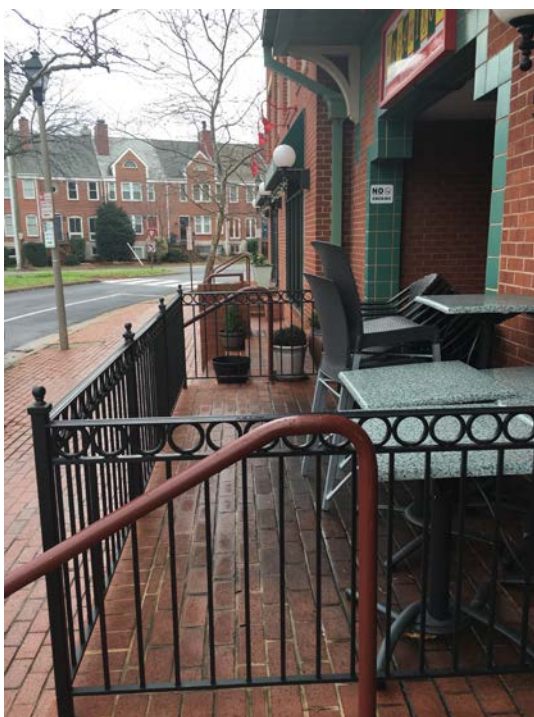
Figure 1: Area A existing conditions

The applicant proposes two encroachment areas into the public right-of way, located in front of the restaurant (Figures 1, 2, 3). Area A is proposed as a 3.5 foot wide and 13 foot long encroachment, which represents a portion of an existing elevated patio located to the west of the restaurant main entrance. Four seats and two tables would be placed in Area A. The proposed encroachment for Area B measures five feet wide and 33.5 feet long into the public right-of-way. A second elevated patio and new steps would be created at Area B, where the applicant would arrange twelve chairs and six tables (Figure 4). This would require the removal of existing steps and a handicap-accessible ramp. A new ramp would be constructed between the entrances for the dry cleaner and the salon. Sixteen of the 22 outdoor seats would be located in the proposed encroachment area. (Twelve of these seats are proposed through SUP #2015-0130.)