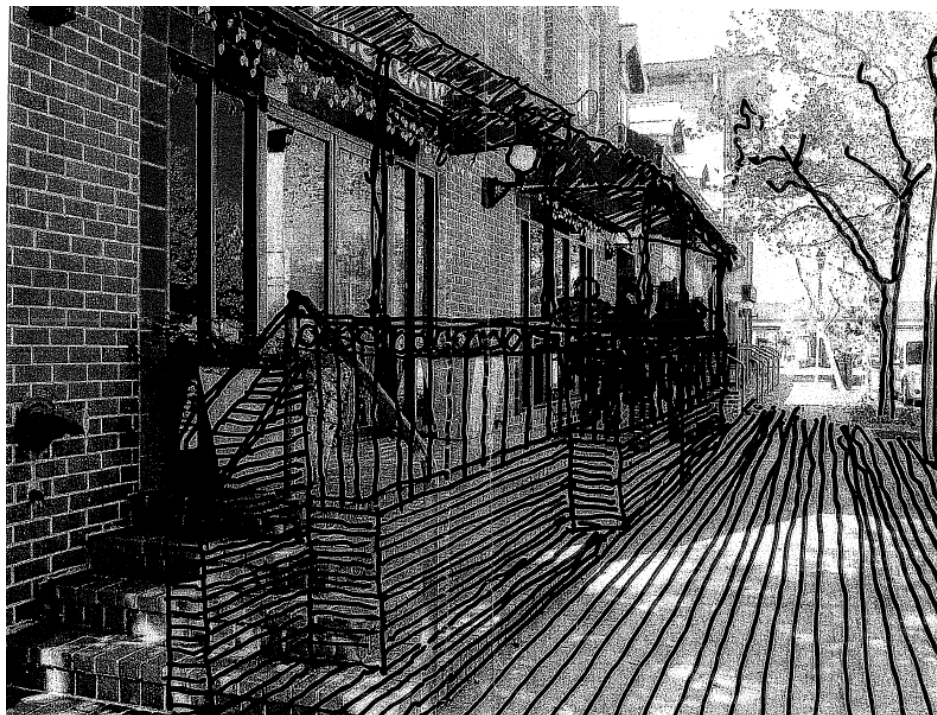
Figure 4: Sketch of the proposed Area A outdoor dining patio