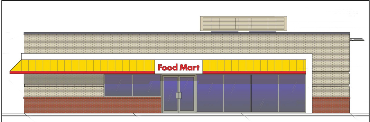
Figure 2: Edsall Road Elevation (South)