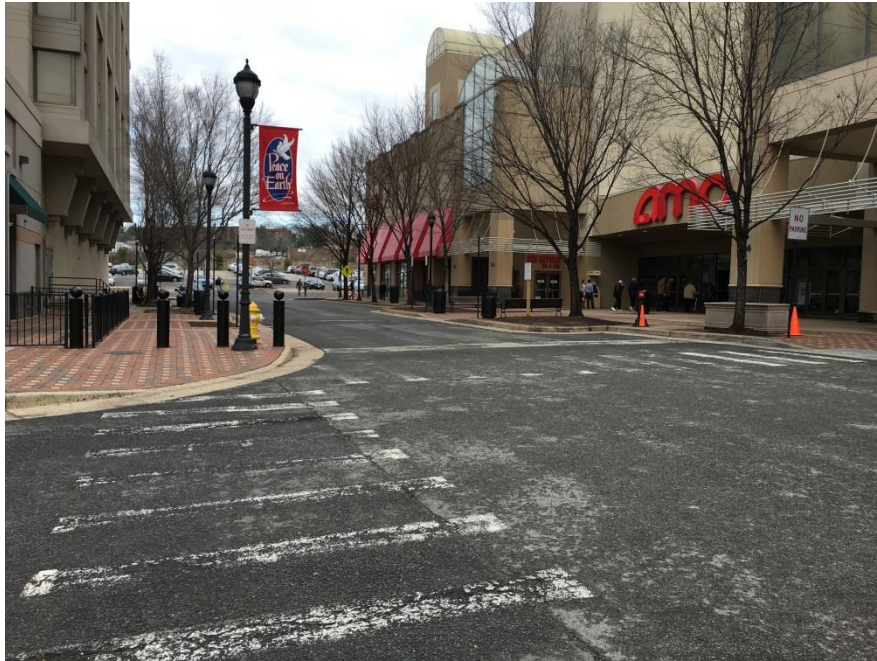
Swamp Fox Road Looking North