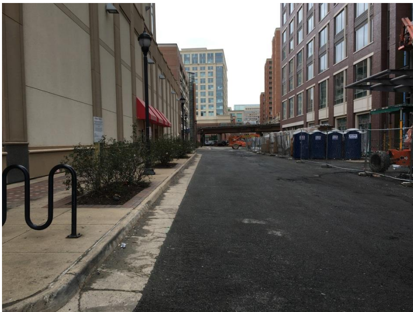
Gristmill Place - Looking East