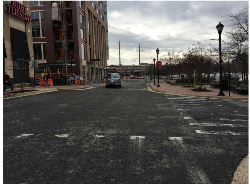
Swamp Fox Road Looking South