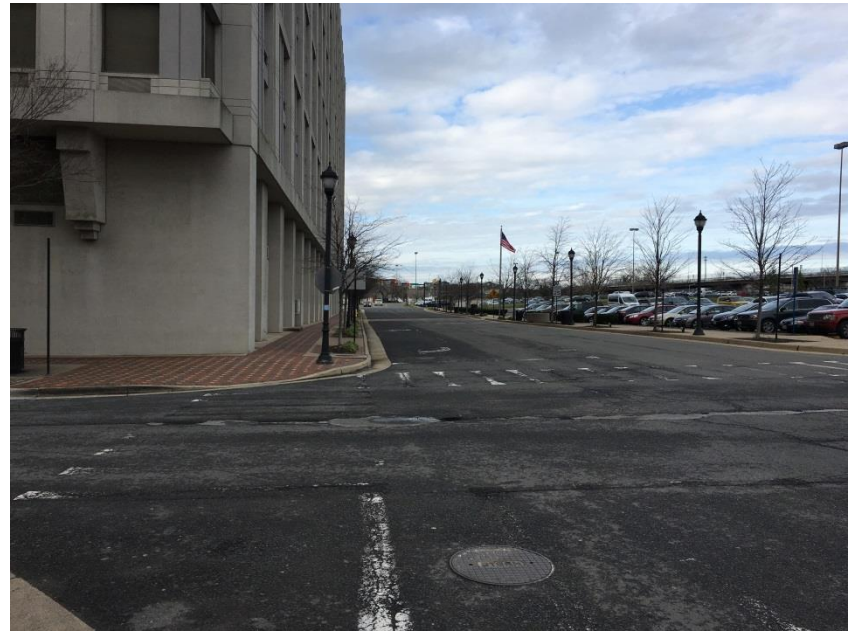
Mandeville Lane - Looking West