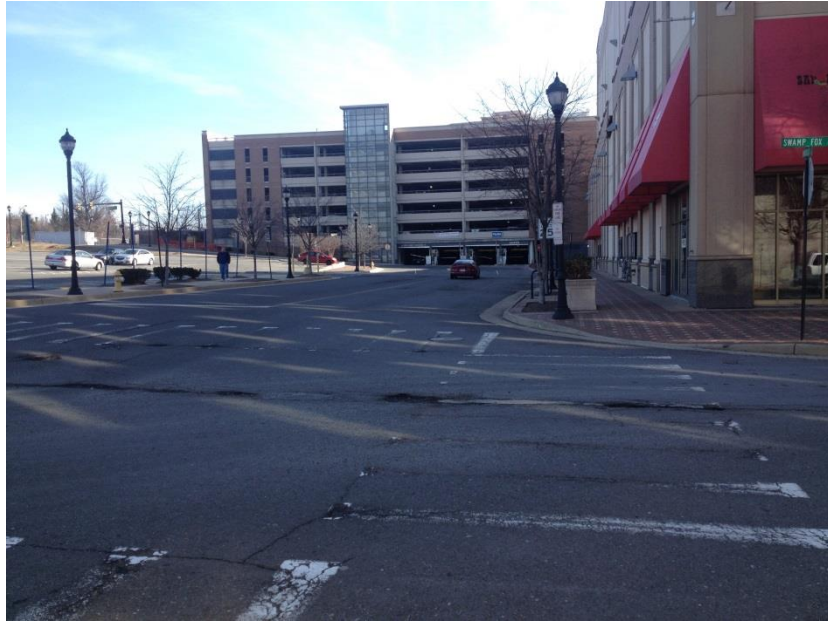
Mandeville Lane - Looking East