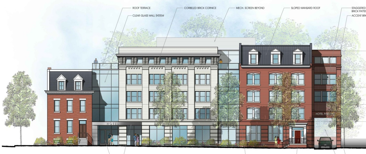
Madison Street Elevation